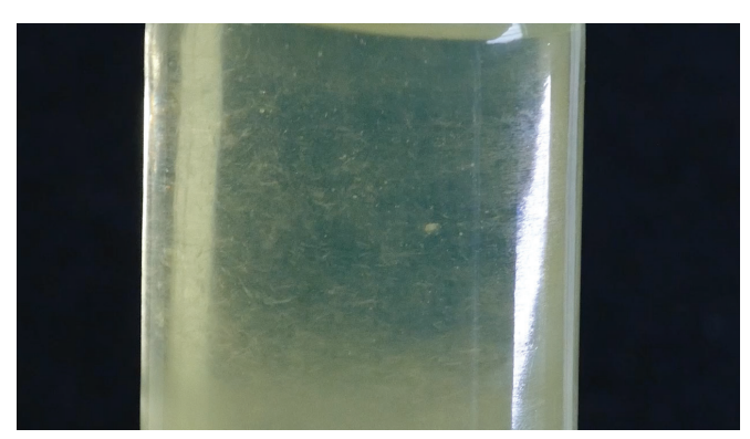
Wax crystals in untreated diesel fuel. The wax crystals will eventually fall out of solution and plug the fuel filter.