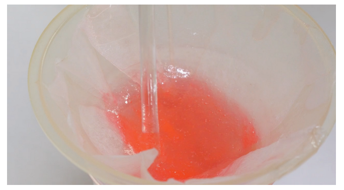
Wax formation in untreated diesel fuel plugs a coffee filter.