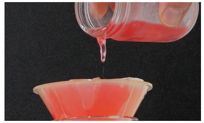
Wax formation in untreated diesel fuel resists pouring.

lowers the cold filter-plugging point (CFPP) by up to 40^{\circ} F (22°C) in ULSD.