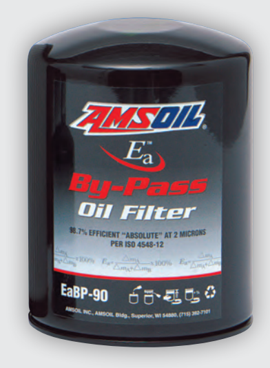
EaBP90 • EaBP100 • EaBP110 • EaBP120

AMSOIL Ea Bypass Oil Filters provide maximum filtration protection against wear and oil contamination. Working in conjunction with the engine's full-flow oil filter, AMSOIL Ea Bypass Filters operate by filtering oil on a "partial-flow" basis. They draw approximately 10 percent of the oil sump's capacity at any one time and trap the extremely small, wear-causing contaminants that full-flow filters can't remove. AMSOIL Ea Bypass Filters typically filter all of the oil in the system several times an hour, so the engine continuously receives analytically clean oil.