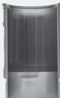
Severely Scuffed Liner