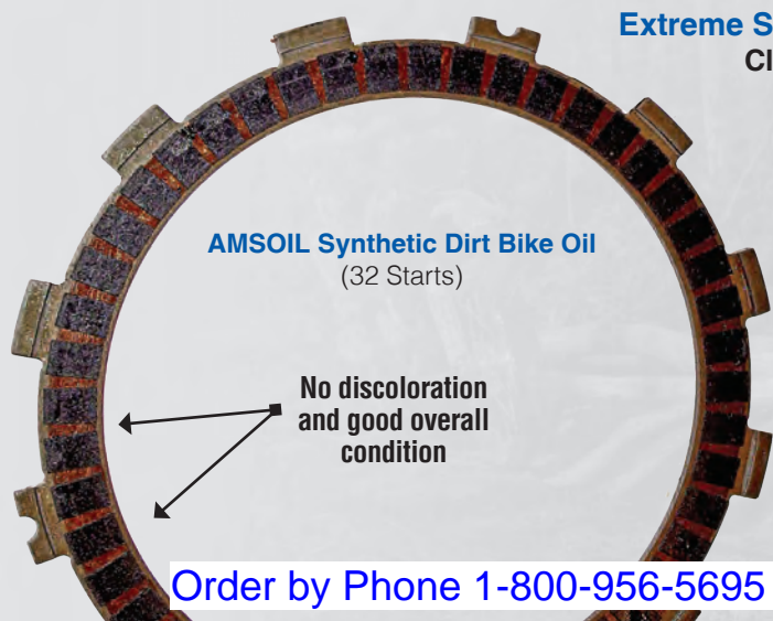
AMSOIL Synthetic Dirt Bike Oil (32 Starts)

No discoloration and good overall condition